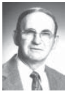
Jimmie B. Davis