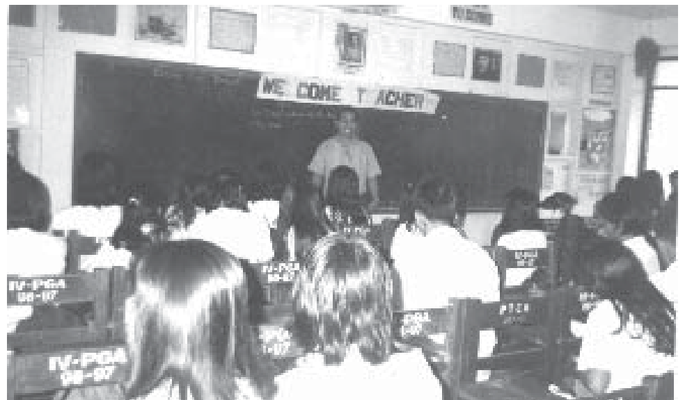
These are fourth year high school students attending the Bible study. Please remember this campus ministry.