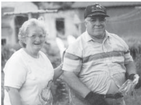
"Didn't Adam and Eve start in the garden?"

"And the Lord God said, it is not good that the man should be alone; I will make him an help meet for him. And out of the ground the Lord God formed every beast of the field, and every fowl of the air; and brought them unto Adam to see what he would call them: and whatsoever Adam called every living creature, that was the name thereof; . . . but for Adam there was not found an help meet for him. And the Lord God caused a deep sleep to fall upon Adam, and he slept: and He took one of his ribs and closed up the flesh instead thereof; and the rib, which the Lord God had taken from man, made He a woman, and brought her unto the man. And Adam said, this is now bone of my bones, and flesh of my flesh: she